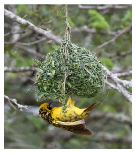
Cloning not allowed