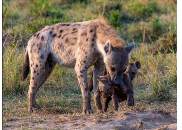
Original, with some blurring due to limited depth of field.

Blurring the background during processing is not allowed, particularly when it is done for the purpose of obscuring human-made objects or when it creates an unnatural looking image. For example,