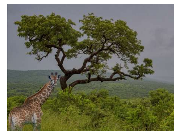
Adding an image element is not allowed