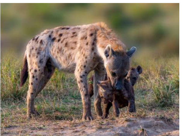
Unacceptable blurring during processing.